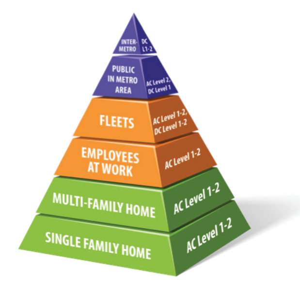
Figure 4. Charging Pyramid