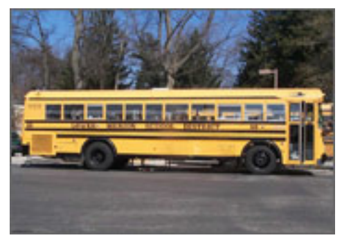
Lower Merion School District has a fleet of more than 100 CNG buses.

In the case of the Lower Merion School District in Ardmore, Pennsylvania, a journey of 6 million miles began with a single bus. In 1995, the district's first compressed natural gas (CNG) bus began serving the community. Since then, the CNG fleet has expanded to 72 buses. Over the years, the district's CNG buses have traveled more than 6.2 million miles, displacing approximately 1.3 million gallons of diesel fuel. In the 2003-2004 school year alone, the fleet logged more than 900,000 miles and used more than 180,000 gasoline gallon equivalents of CNG.