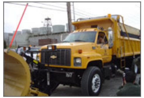
MoDOT's fleet includes 2,100 heavy-duty vehicles like this dump truck, which is fueled with biodiesel.

Established in August 2003, the Missouri Biodiesel Fuel Revolving Fund offers state fleets a way to earn money to offset the incremental cost of biodiesel or expand biodiesel infrastructure. The fund receives payments from the sale of EPAct credits from covered fleets like MoDOT, which generates the credits through over-compliance with EPAct requirements.