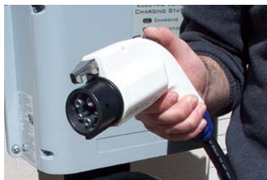
This EVSE, equipped with a SAE J1772 connector, can be used to charge PEVs.

The first point of distinction is the type of electric current—alternating current (AC) and direct current (DC). Some EVSE provides AC electricity to the vehicle, which is converted to DC using equipment onboard the vehicle, then delivered to the battery. Other EVSE provides DC electricity without any conversion. Within these two current types, the industry has defined (or is in the process of defining)