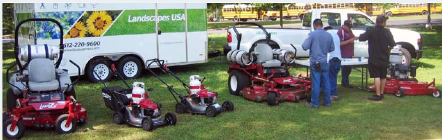
Clean Cities coalitions in Texas have helped plant the seed for propane lawn mowers in the Lone Star State.

CTCC distributed the last propane mower rebate in October 2010, but the project’s momentum is still evident in the Texas landscaping world and beyond. Program participants included some of the state’s largest landscaping companies, and they have since added more propane mowers to their fleets. Some operators are so impressed by propane that they’d like to have their trucks converted to run on this affordable, clean fuel. Today, more than 14 manufacturers are selling propane mowers in Texas. CTCC is proud to have played a part in making the state’s lawns a little greener and to have laid the groundwork for similar programs in other states.