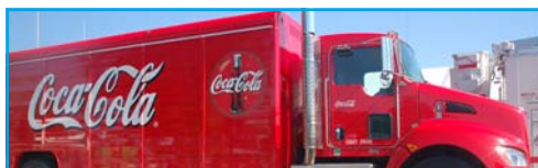
Stakeholder Summit: p6

Clean Cities Now is published biannually. View an electronic version at www.eere.energy.gov/cleancities/newsletter.html . To order print copies, go to www.eere.energy.gov/library .