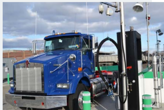
Clean Cities coalitions in Connecticut helped bring LNG to the East Coast. The new Enviro Express station in Bridgeport fuels long-haul trucks with LNG, and it dispenses CNG to other customers.

Enviro Express isn’t the only company benefitting from the new station. Other commercial fleets, including 50 vehicles from AT&T, use the facility for CNG fueling. And the station is attracting attention from public- and private-sector organizations throughout the Northeast who are concerned about the rising cost of diesel fuel and are looking for alternatives.