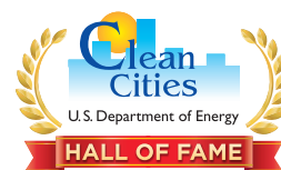
Coordinators inducted into the Clean Cities Hall of Fame: p5