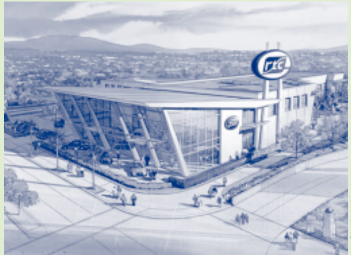
Artist's rendering of the RTC in San Diego, which opened on August 8.