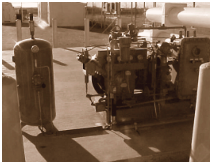
Weld County, Colorado acquired a CNG fueling station with funding from a settlement with an energy company.

Enforcement settlements with EPA can result from violations of many different environmental regulations and standards. Most common are cases dealing with standards established by the Clean Air Act. Within that realm is a complex section called New Source Review (NSR). When emitters such as power plants are modified, by law they must disclose the modifications to a regulating authority and apply for an NSR permit. Many have failed to do so in the past decade, resulting in many enforcement settlements with EPA and with states, either signed or pending. At least 10 NSR settlements are in progress, and many more NSR cases are under investigation.