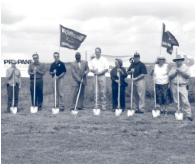
Aviation Department, Austin, Texas/PX 12691