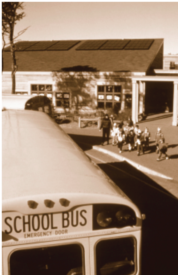
School bus exhaust is often targeted in settlement projects, which can pay for new vehicles as well as diesel retrofitting.

Get involved in the process early—if possible, before the consent decree is signed. Often that’s not easy, he admits, because settlement negotiations happen behind closed