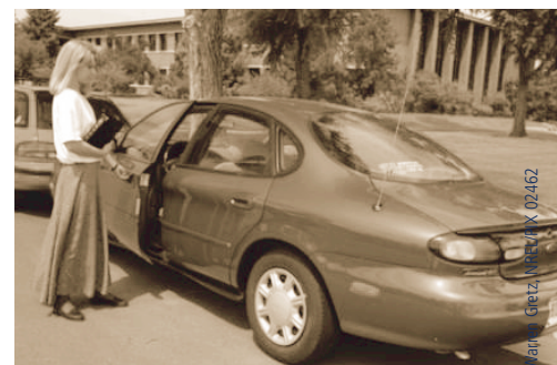
The AFV resale market is an emerging opportunity for both fleet purchases and private individuals.

in a special section of its Web site. NGVC's market exchange, located at www.ngvc.org/mktxch.html , typically features seven to ten vehicles at one time. "People have found the site to be a viable medium for selling vehicles," said NGVC's David Steele, Director of Communications and Member Services.