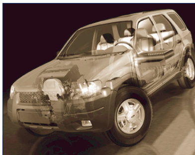
The hybrid-electric Ford Escape is designed to get 40 miles per gallon when it debuts in 2003.

For more information about Ford Motor Company and its alternative fuels activities, check out www.fleet.ford.com/products_services/alternative_vehicles/default.asp or call 877-ALT-FUEL.