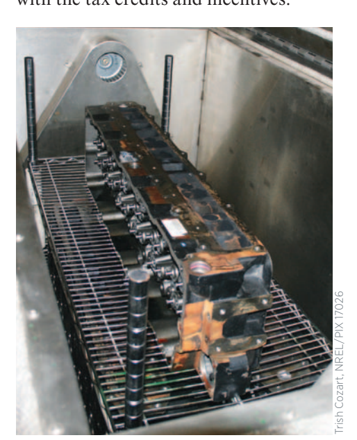
ESI's cryogenic freezer supercools components, making them even better at withstanding high engine temperatures.

Natural gas is certainly clean burning, domestic, and plentiful, but the movement to this alternative fuel strategy didn't really gain traction until there was an economic benefit to the customer. "In the summer of 2008, when crude hit $148 a barrel—that is when the paradigm changed," says Moore. "And even though crude prices have been vacillating ever since, most fleet owners believe it is just a matter of time until crude prices hit triple digits again. So now it's clean, it's domestic, and we really have an economic case, particularly with the tax credits and incentives."